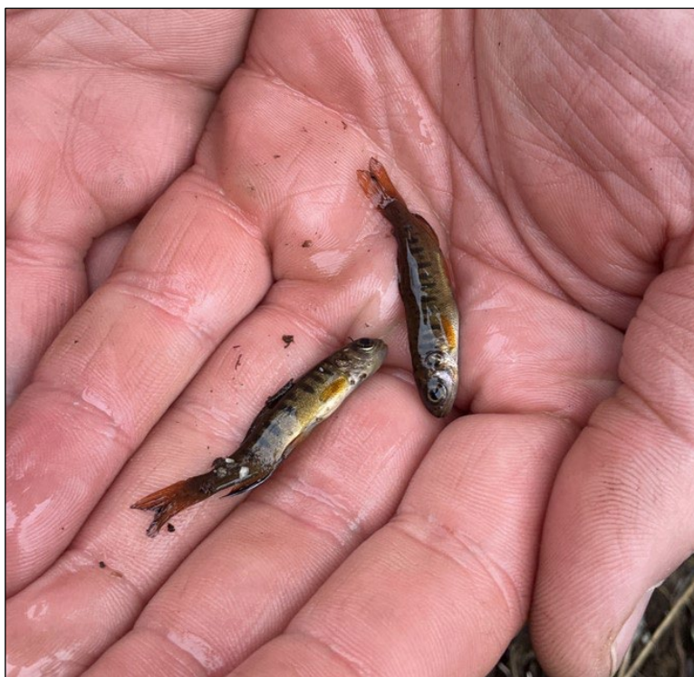
Figure 1.—Juvenile coho salmon captured at waypoint 1228.