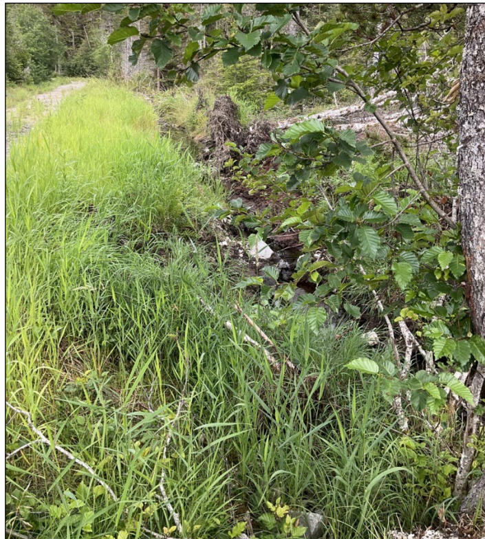
Figure 3.– Channel upstream of waypoint 1228.