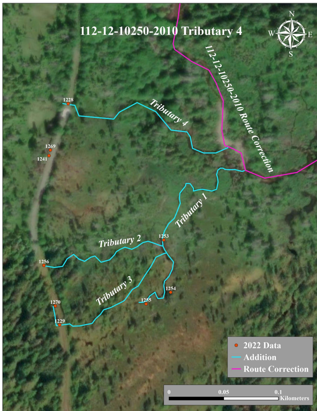
Figure 4.–112-12-10250-2010 tributary 4 addition map.